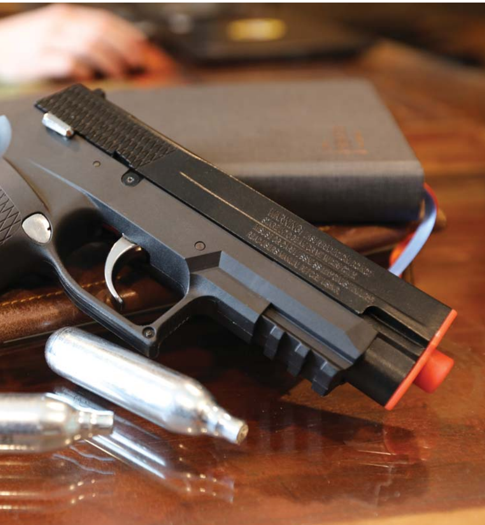
The Blowback Laser Trainer is CO 2 -powered by a small canister that seats in the magazine, creating recoil-like blowback to enhance the at-home training experience.

On average, I was getting 47 trigger pulls from a single CO 2 cartridge, which is very reasonable given the amount of inertia it takes to drive the slide. Remember: It's for the weight and feel of a "real" gun overall, including the slide. CO 2 canisters are not hard to come by, and Blowback sells a 20-count box of them on their website for $20.